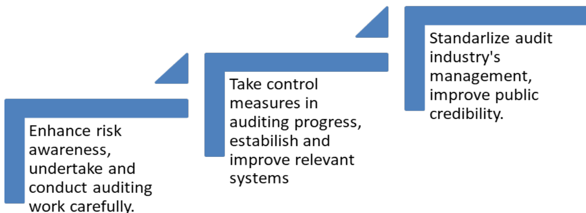
Figure 2. Audit risk control for 3 phases